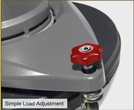
Simple Load Adjustment