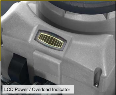
LCD Power / Overload Indicator