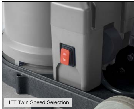
HFT Twin Speed Selection