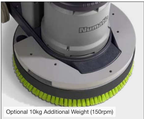
Optional 10kg Additional Weight (150rpm)