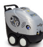
MAC DROP PRO & STANDARD