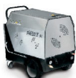
MAC AVANT XL