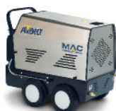
MAC AVANT / ZP