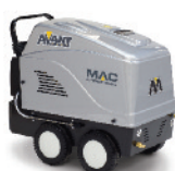
MAC AVANT GRP