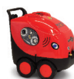
MAC DROP REVOLUTION