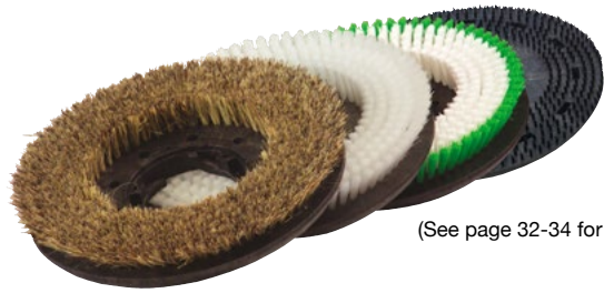
(See page 32-34 for Full Accessories)

The NuSpeed range of professional FloorCare machines has been specifically designed to provide optimum results whatever the application.