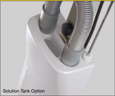
Solution Tank Option

Optional pad interchange systems, quick, simple and secure.