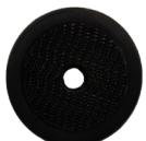
55mm Scotch Brite Round Pad